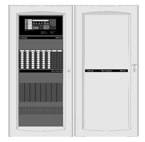
Figure 3: 4100ES Three bay cabinets