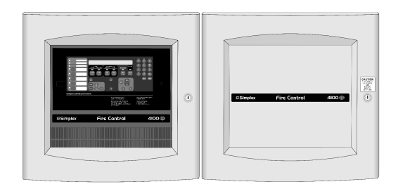
Figure 1: 4100ES One bay cabinet