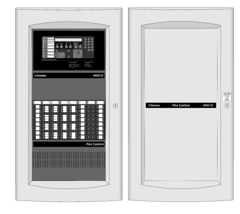
Figure 2: 4100ES Two bay cabinets